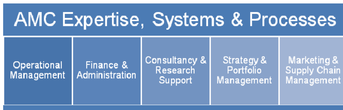
Figure 5: AMC Agricultural Systems & Processes Expertise

The specific aspects of this role are detailed in the following sections “Agricultural Expertise” and “Systems and Processes”.