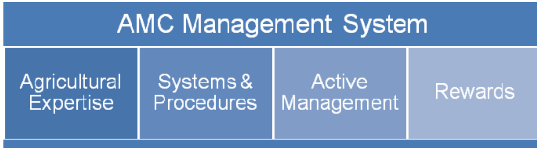
Figure 2: Elements of the AMC Management System

Section 3 details each of these key elements of our management system.