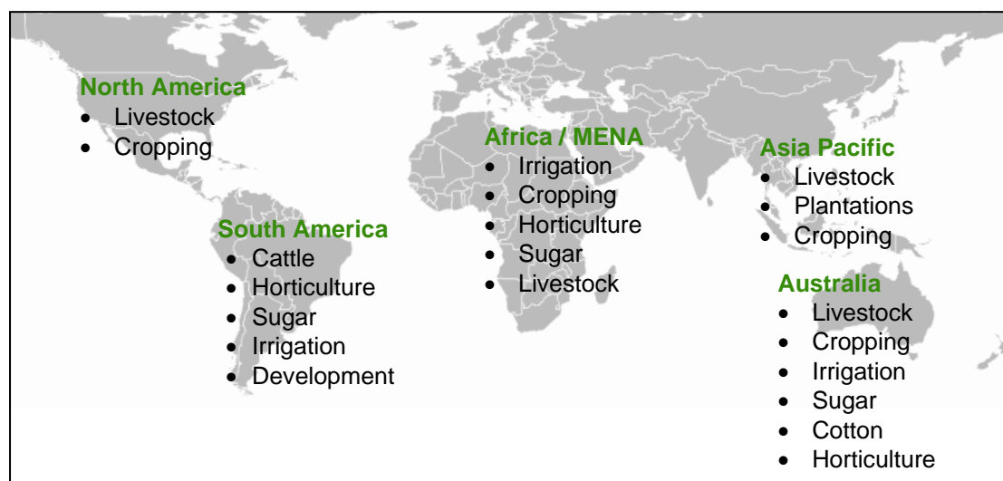
Figure 1: AMC Global Experience

AMC's business is influenced by global trends, namely a new wave of investment in agriculture from both private and institutional funding sources. AMC operates in the global market and provides management and advice to agricultural investors throughout the world. AMC's global experience is shown in Figure 1.